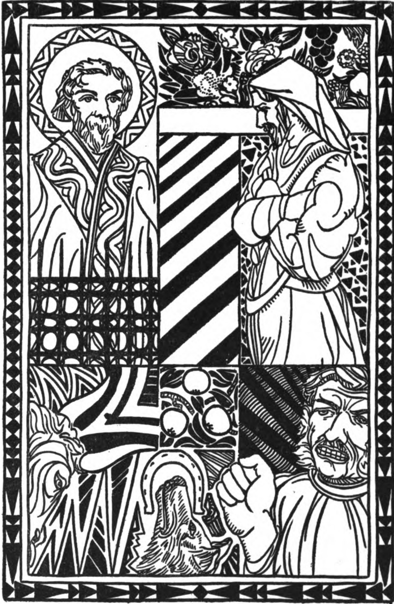
The Beggar's Garden